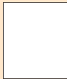
To be elected