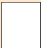
To be elected