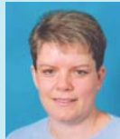
Liz Phillips Medical Service Unit