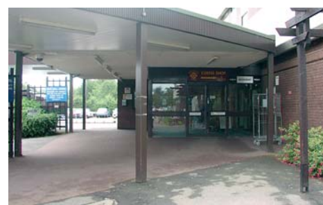
Edith Cavell entrance